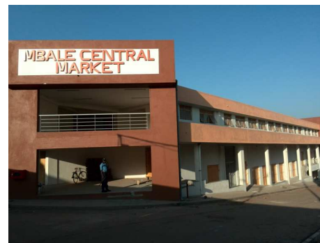
Fig.1 Mbale Central Market

1) project which is set for completion early in 2014.