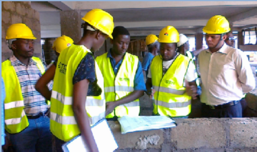
Engineers consulting on the Mbale Market site